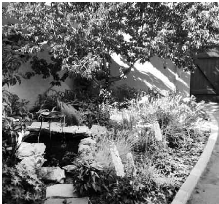
Visit beautiful gardens on tour June 3!