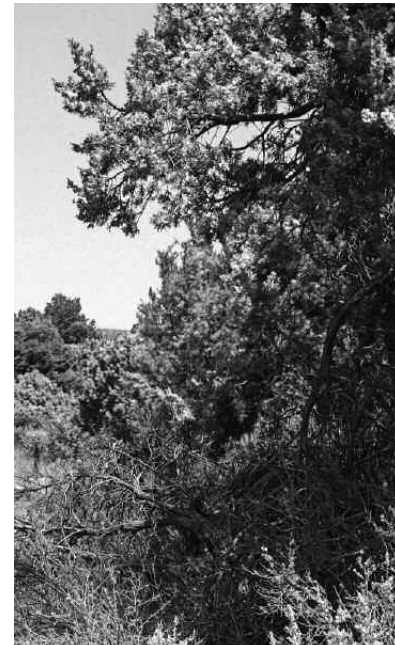
Vegetation like this too close to a residential structure may be a fire hazard!

ECIA Board Meeting, Community Center, Thurs., June 21, 7 pm.