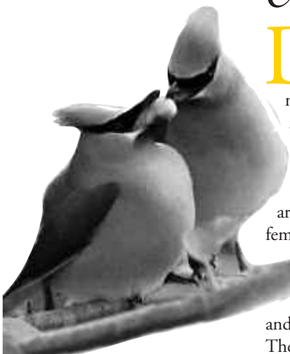
Cedar waxwings passing a berry back and forth.

Read more about the snowy owl population surge on our website: www.eldoradosf.org