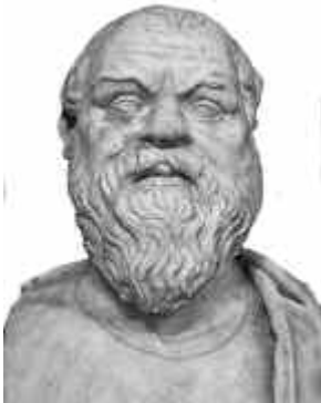
Get philosophical at the Socrates Cafe—at Mi Amor in La Tienda

Summer performance and fall sign-ups in August