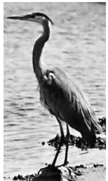
Blue heron from Bolsa Chica

A contribution of $5 is suggested at the door.