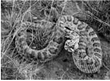
Rattlesnake in New Mexico.

For our new residents and, as a reminder, for our established residents, Neighborhood Watch, a volunteer program, provides a great way to ensure safety for ourselves and neighbors through vigilance and awareness. We focus on safety issues, including potential and actual criminal activity and emergency preparedness.