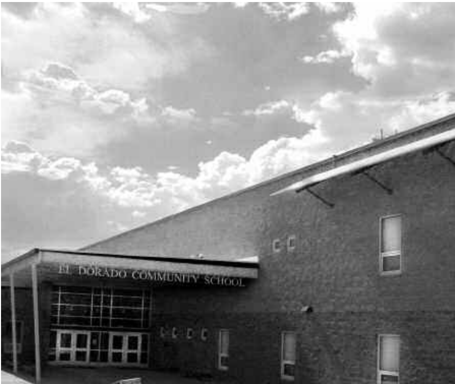
El Dorado Community School's new entrance (with solar panels) and playing field.