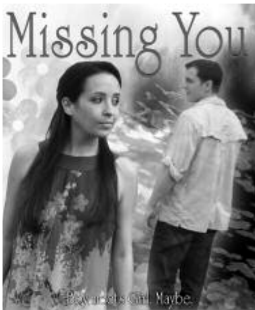
Presented by Reel New Mexico, October 11, 7 PM, at La Tienda Performance Space