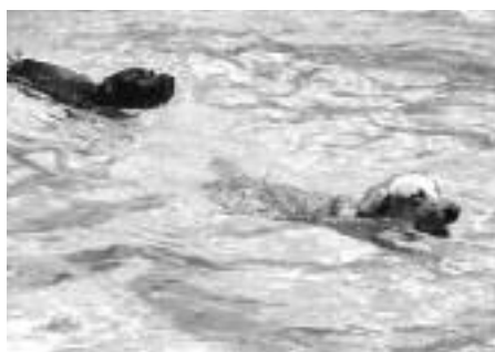
Bring your dog and enjoy the end-of-season Paws in the Pool event, Sunday, October 7.