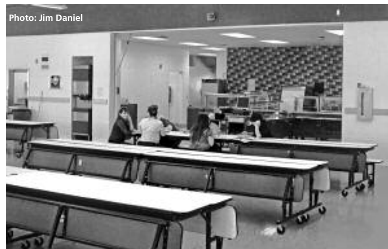
The school's new cafeteria.