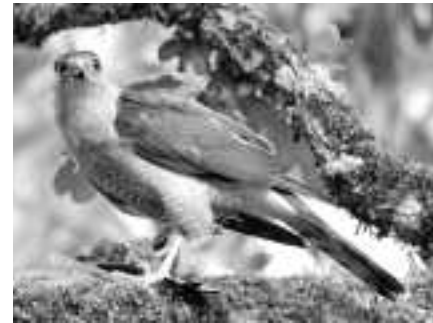
Sharp-shinned Hawk.