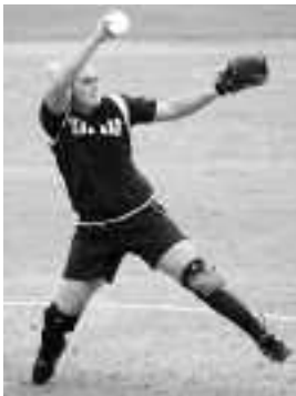
Join in co-ed adult softball in April.