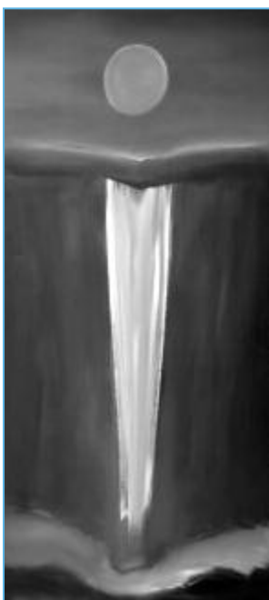
Artist Maria de Echevarria is participating in the Spring Studio Tour. See details on back page.