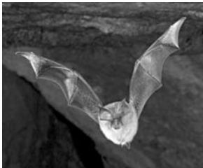
Learn about bats on July 31! Lesser Horseshoe Bat.