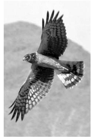
Female Northern Harrier Circus hudsonius flying at Bosque del Apache National Wildlife Refuge, NM.

References for this article are available upon request. We love hearing from you! Contact us at EldoradoFloraFauna@yahoo.com .