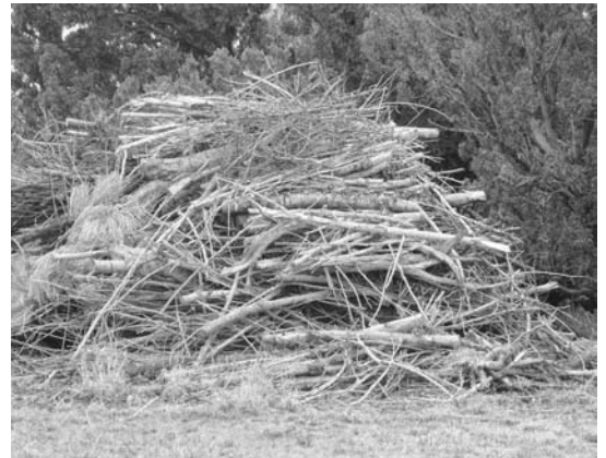
Remove any piles like this off your lot!

The third fuel component consists of isolated brush piles generally created by homeowners during landscape activities. These are best represented by Fire Behavior Prediction System model #10 (light slash) and generally contain up to 11+ tons/acre of fuel. Once cured, these can be highly flammable with flame lengths in excess of 20 feet, very high intensities, and strong resistance to suppression. Rate of spread is very low, even in a high wind situation, but there is high potential for localized damage to soils and adjacent vegetation or structures. Fuels in this model are the most likely to actually create a spotting problem here in El Dorado.