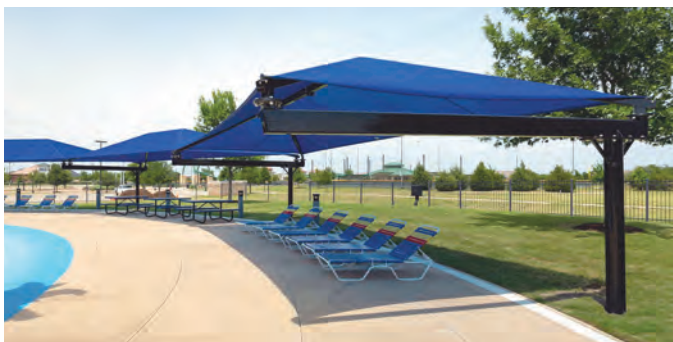
Example of the three permanent shade structures which will be installed at the pool.

E ldorado pool Phase Two renovations have started, and will finish in time for a Memorial Day opening. Phase Two includes a new structure for a family changing room, permanent shade structures, and other outdoor amenities. The mechanical room will be renovated and a new filtration system and boiler will ensure ideal water quality. All projects are within budget and have been approved by the Finance Committee and the Board of Directors.