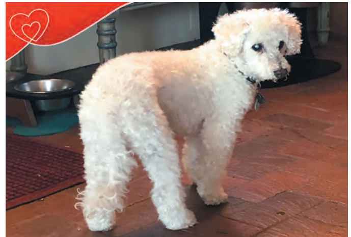
'Grandpa' in his new forever home in Eldorado.

No expenses were spared for Grandpa; he even received chiropractic adjustments.