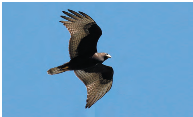
Zone-tailed hawk in flight.

Perhaps it's their steely gaze, or their powerful, hooked bill and dagger-like talons. Maybe it's their rocket swift flight or their stunningly keen eyesight. But more likely our visceral fascination stems from admiration of all these traits. Raptors it seems have charisma in spades!