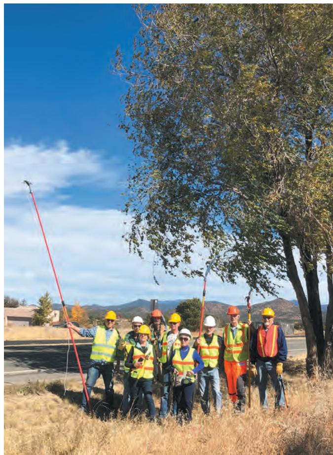
Members of The Eldorado Roadside Tree Project.