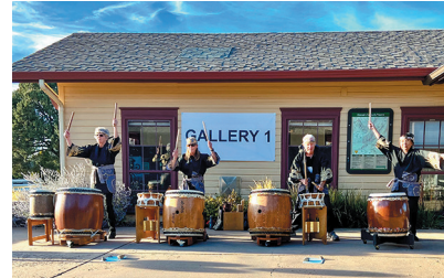
The Santa Fe Wadaiko drummers perform at the Community Center.