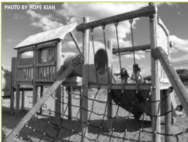
The Playground at Compadres