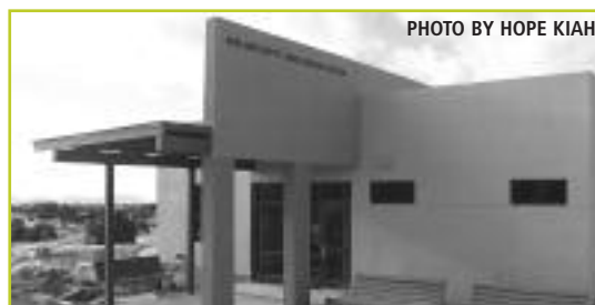
Volunteers needed to help at the Senior Center.