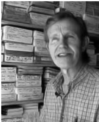
Reel New Mexico features a documentary about Taos author John Nichols, March 12.