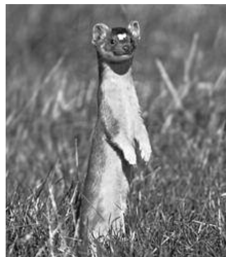
Top: Black Footed Ferret Bottom: Long Tailed Weasel

Additional wells have been drilled and emergency generators have been installed to ensure that, in the event of an extended power outage, water will continue to flow to our homes and to local businesses. The latest, important planned addition to our water system will be Well 19, now in the planning and design process. At a total price tag of $1.3 million, it will be made reality on legislative approval of a bill sponsored by our local senator, Peter Wirth, and funds provided by the New Mexico Water Trust Board.