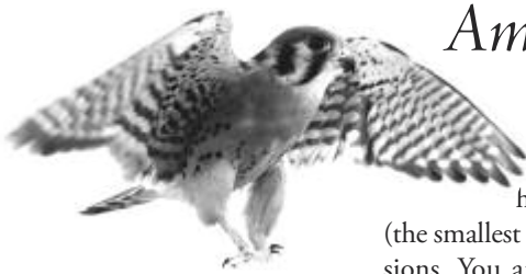
American Kestrel.