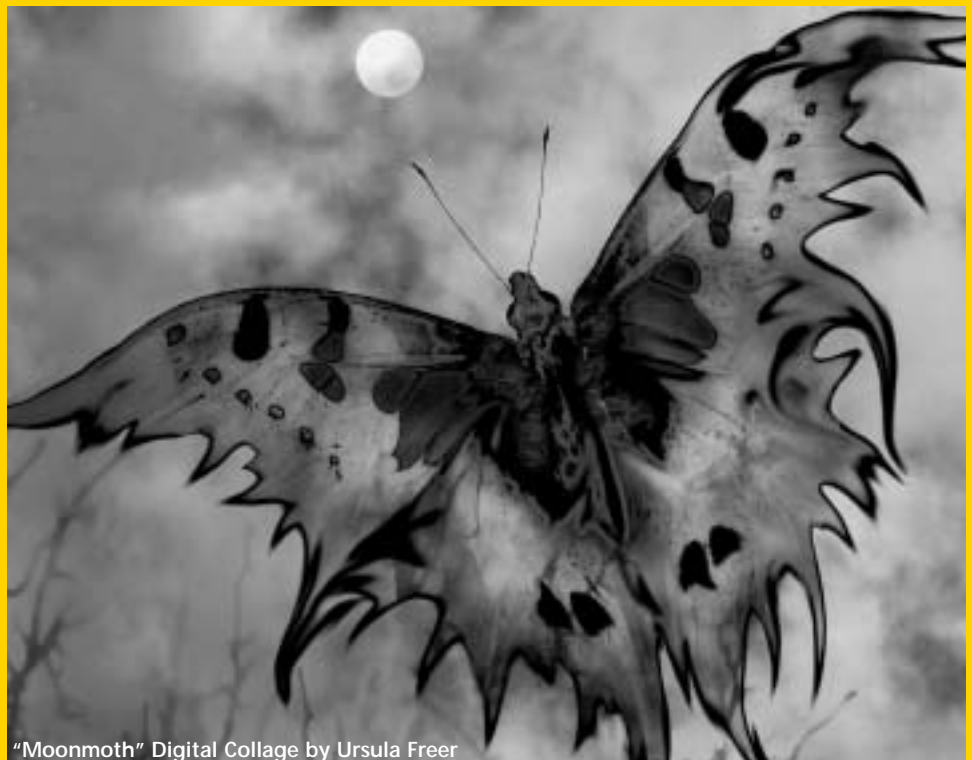
"Moonmoth" Digital Collage by Ursula Freer

The Eldorado Arts and Crafts Association presents the 12th Annual Open Studio Art Tour. Meet, talk and learn about individual artists. May 17 and 18, from 10 am to 5 pm. Pick up a Tour brochure/ map at the Vista Grande Fire Station on those dates.