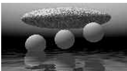
Robert Barnes, digital print, 11.5 x 7.5"