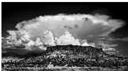
Jack Arnold, photo, 16 x 30"