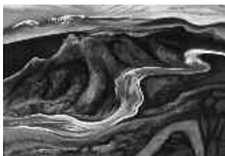
Sally Hayden Von Conta, pastel, 22 x 28"