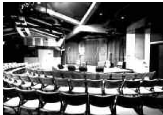
The stage at Santa Fe Performance Exchange in La Tienda.

Fundraising Chair, Santa Fe Performance Exchange