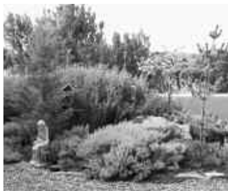
SAVE THE DATE: Eldorado Garden Tour, June 4, 10 am –4 pm.