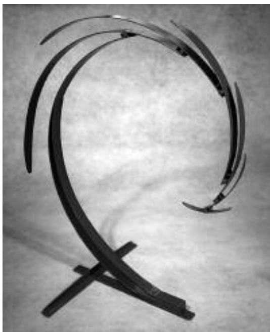
Left: Vincent Faust's steel sculpture, "Impulsion."