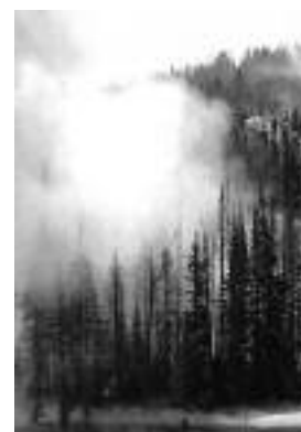
Last year's fire in neighboring Arizona.

ECIA Board Meeting, Community Center Railroad Bldg. Thurs., May 16, 7 pm.