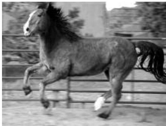
Elmer, photographed in motion by Max Underwood.

During the event that the Stable Committee hosted for the ECIA Board and their families at the stables, they began with a tour that included a look at the new water system and a description of the manure removal program. They answered questions, introduced the horses, and showed grandkids how to safely feed carrots. The tour gave participants a look at the newly resurfaced upper arena. There were horses jumping, doing dressage, western pleasure, and various diverse activities. Board members were able to see first-hand how the newly installed footing has made a tremendous improvement in performance and safety. At the end of the formal tour at the upper round pen, the grandkids and Board family members were offered pony rides.