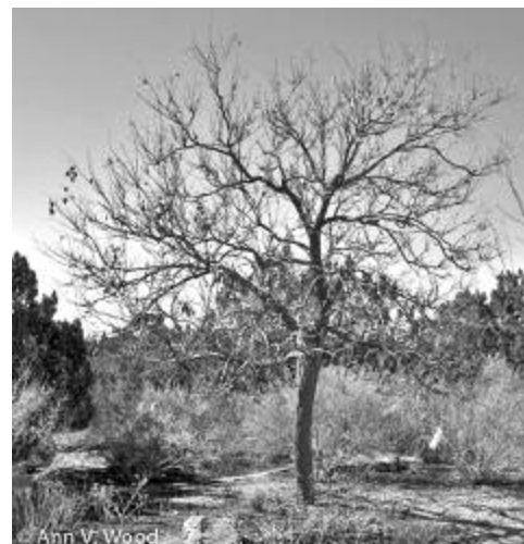
Ann V. Wood

MAY 9 ECC EVENT. Stop by the Eldorado Convenience Center (formerly Transfer Station), May 9, from 10 AM to 2 PM, to learn about new recycling options, see the refurbished recycling area, and have a chance to win local merchant gift certificates. Non-recyclers will learn the value and ease of recycling to comply with the county ordinance that prohibits recyclables in the trash.