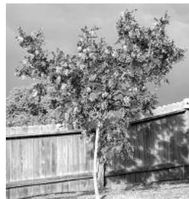
Above, top: Raintree; bottom: locust tree.