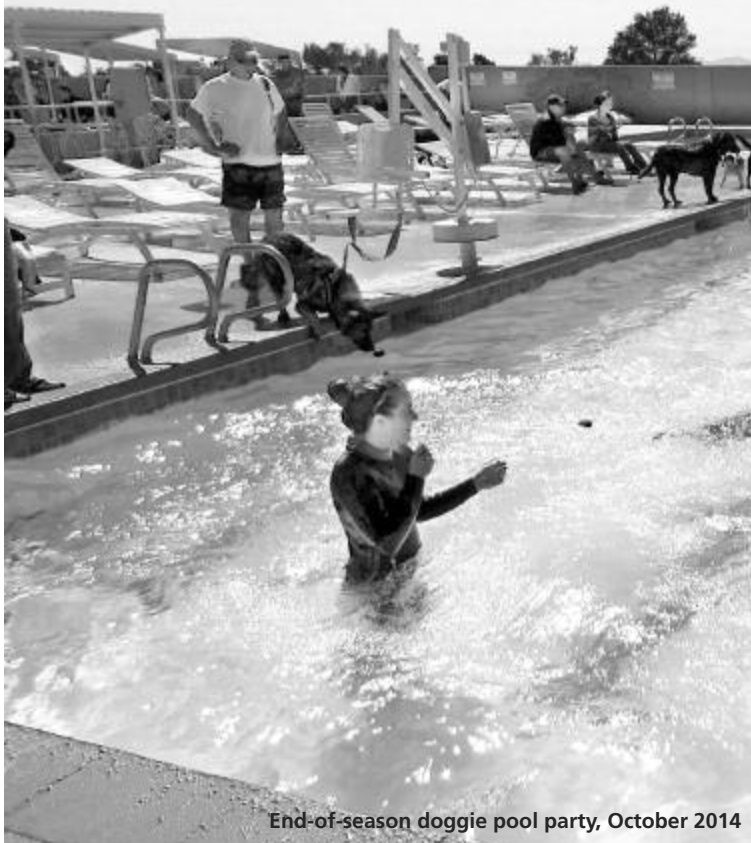
End-of-season doggie pool party, October 2014