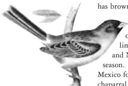
From The Birds of North America; The Descriptions of Species Based Chiefly on the Collections in the Museum of the Smithsonian Institution , by Spencer Fullerton Baird, 1860.