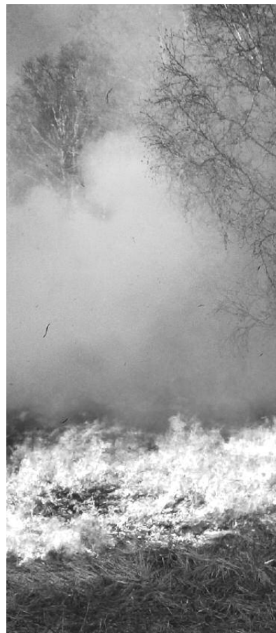
Let this not be Eldorado!

ECIA Board Meeting, Community Center, Thurs., June 16, 7 pm.