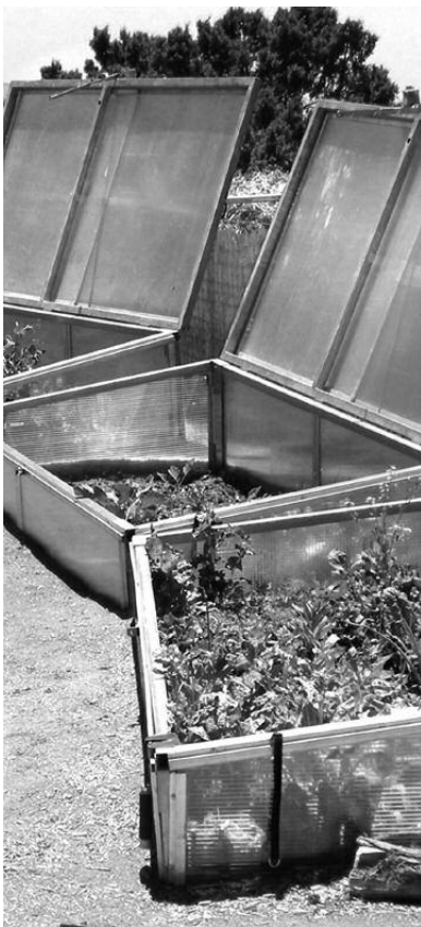
The Community Garden is on view at the Garden Tour, June 4.

8. The Community Garden and Outdoor Classroom is dedicated to sustainable gardens and outdoor learning programs for students and the community. On the 1.5 acres of land, organic gardening is encouraged and the entire garden is herbicide and pesticide free. Features include a labyrinth, cactus garden, picnic area, individual beds, a communal garden, and a new drip irrigation system. For more information, email JWO1959@aol.com , subject "Gardening Tour Question."