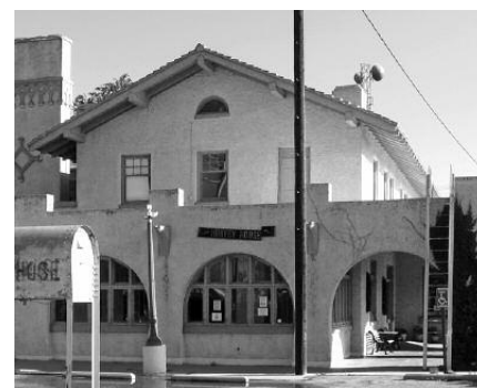
Visit the Harvey House, Belen