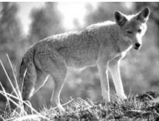
Coyote.