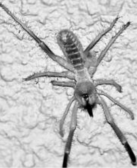
Wind scorpion.