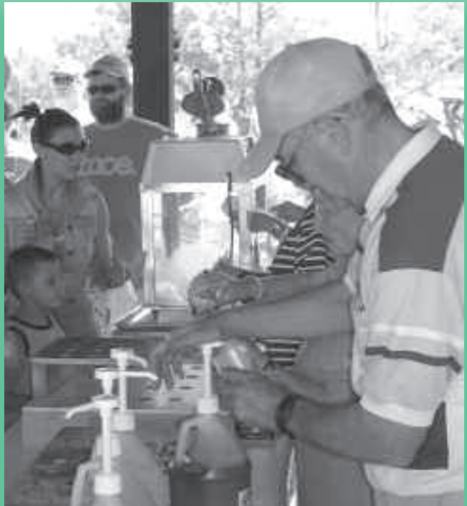
Volunteers build free snow cones for Eldorado residents of all ages.

This wouldn't have been possible without the volunteers who did all the work. Thanks to those who pitched in, especially those who answered the last-minute call for help.