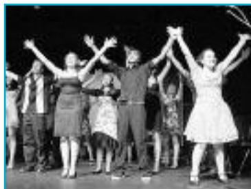
Last year's "Night of Broadway" by the Eldorado Teen Players. More pictures can be seen at eldoradchildrenstheatre.org