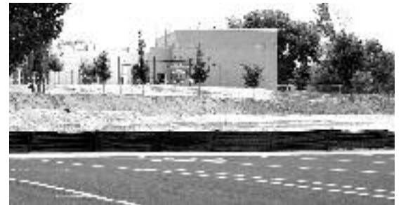
New athletic field at El Dorado Community School.

ECIA Board Meeting, Community Center, Thurs., September 16, 7 pm. Public is invited.