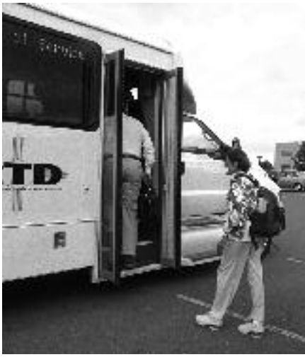
NCRTD Bus has expanded schedule for Eldorado. And it's free!