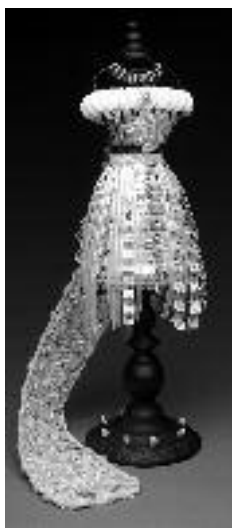
Joy Campbell transforms books into amazing sculptures.

Also at VGPL: The library's Family Night Movie, Friday, September 24, 7 pm, is Earth , a feature-length version of the BBC's dazzling "Planet Earth" documentary series.