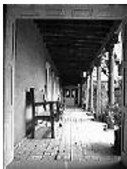
Historic San Ysidro

The Center has planned an October 6 trip to the Albuquerque Museum's historic Casa San Ysidro, also known as the Gutiérrez-Minge House, located in Corrales, just north of Albuquerque. The original