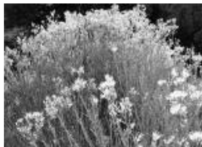
Chamisa in bloom.