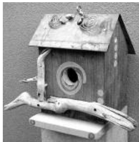
"Out on a Limb" by Al Hockwalt