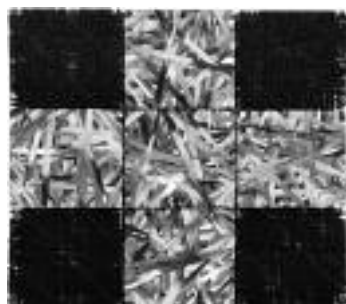
Mixed media by Holger Schmidt, coming to La Tienda Exhibition Space October 5.