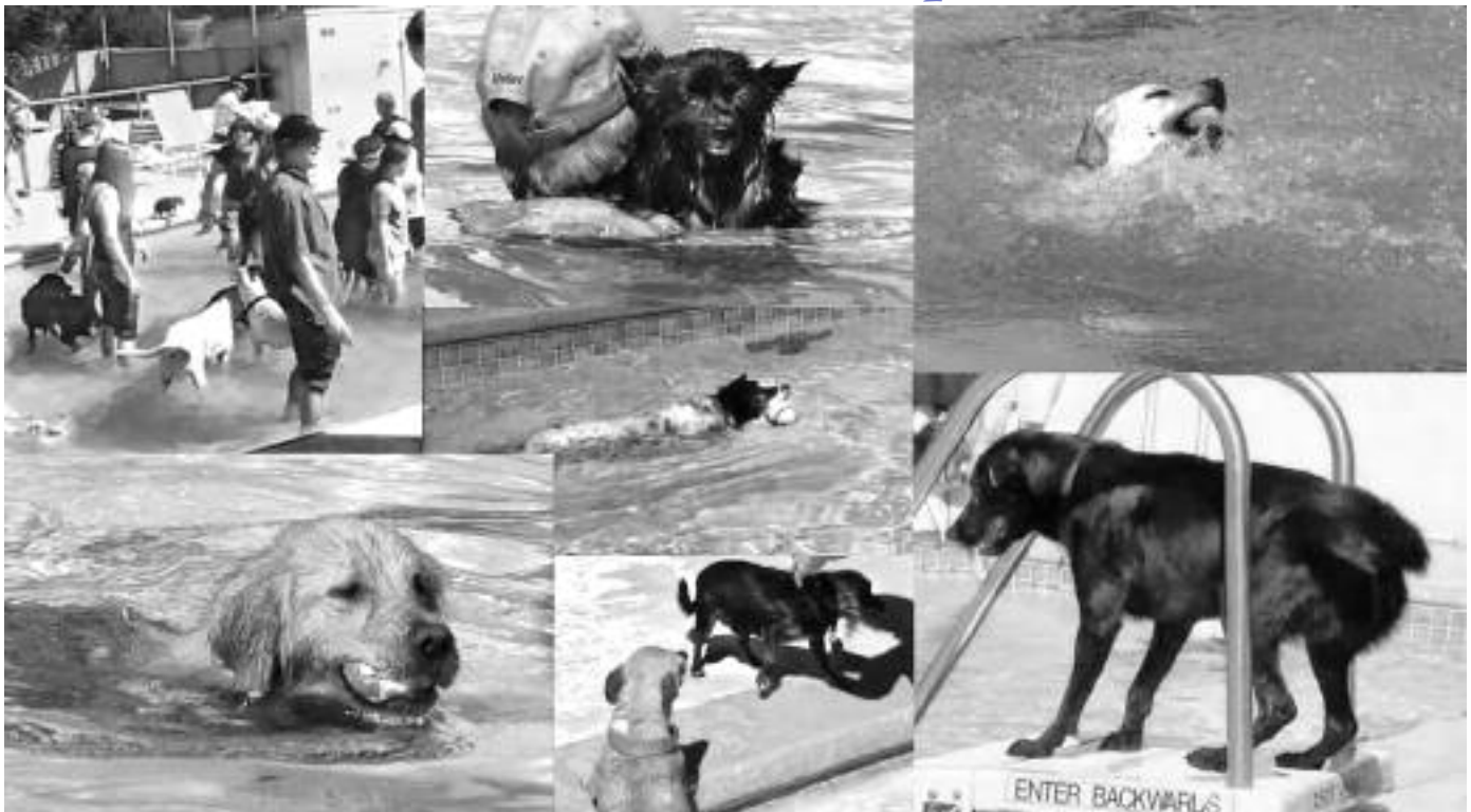
Stills from video "Eldorado Doggie Pool Party" by William Salopek, http://www.youtube.com/watch?v=SZLwwh_8FLI .