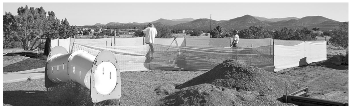
Renovated Community Center grounds (left); work in progress at Compadres Park (above).