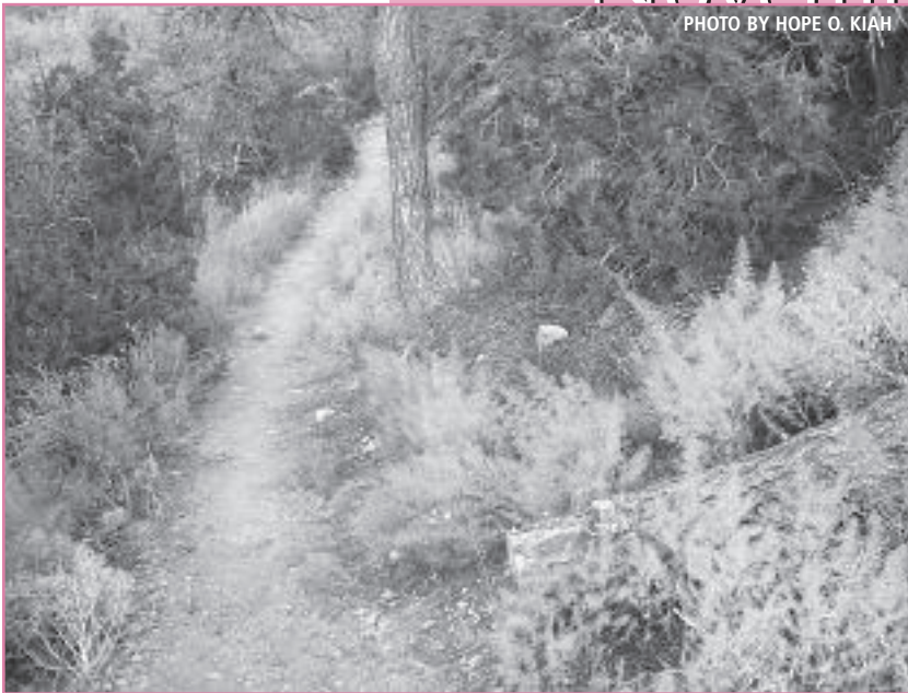
A portion of trail 101