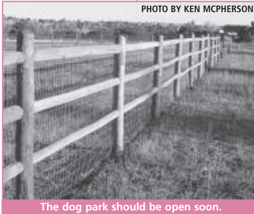
The dog park should be open soon.