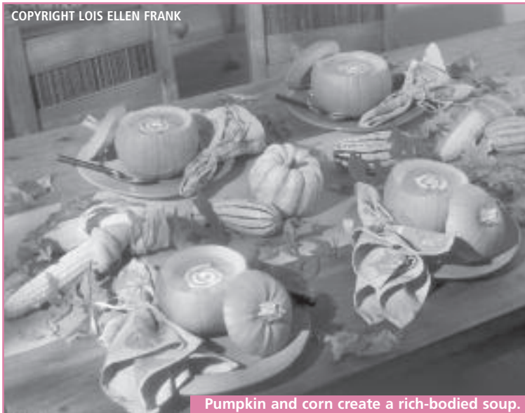
Pumpkin and corn create a rich-bodied soup.