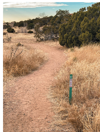
Pueblo Cañon trail access from Enebro Road

native vegetation, increase erosion (with the tendency to take the shortest route—usually directly down or upslope) and trespass on private lots. Dog waste along these trails contaminates the watershed, contributing to pollution and the spread of disease to wildlife. Walking or biking on the trails when wet, worsens erosion and widens the trails, as we try to go around those spots. In several cases, stabilization has been required to avoid additional erosion or damage to the watershed, for which the Greenbelts were established.