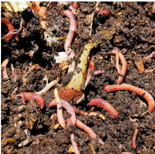
Red wigglers composting

It's springtime and a great time to get into strawbale vermicomposting! Convert your kitchen veggie waste into rich garden soil, thanks to the voracious appetites of red wiggler worms. Already composting? Great! Now is a good time to harvest your compost soil from the winter and tune up your bin with fresh moistened straw for the growing season. Want to get started with strawbale vermicomposting? Contact Chris at clharrell505@gmail.com . We've got the straw, the worms and even some songs to teach you all about it!