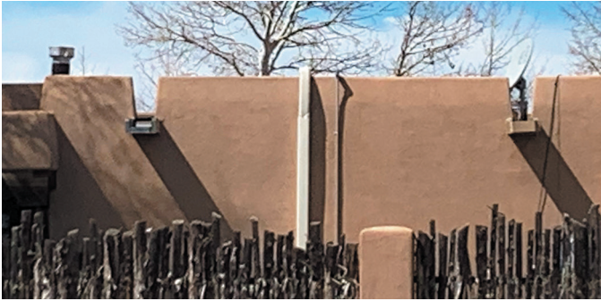
Eldorado residence with non-compliant white ducting

Over the past few years, ECIA continues to see an increase in the number of Eldorado homes that are installing newer heating and air conditioning units that involve running exterior ducting, pipes and conduits from the roof, as well as from exterior walls. This ducting is usually white and often very visible to neighbors. Additionally, we have noted many new Radon Mitigation systems that are also very white and visible to neighbors.