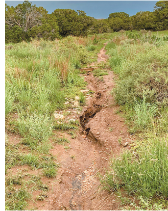
Left, erosion on one of the social trails; Right, trail stabilization work by the ECIA Conservation Committee

Thus, almost all the 'trails' we use in the Greenbelts are 'social trails'. That is, they have been made by residents who repeatedly walk in an area until a pathway is created. Because the soils in our Greenbelts are highly erodible, every time a new social trail is created, it has a negative impact on the drainage of water in the Greenbelts. It can also damage