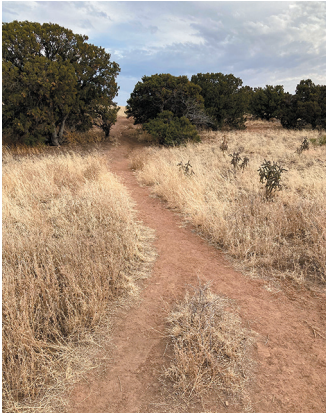
A social trail off Pueblo Cañon trail

A lthough many Eldorado residents use trails in our Greenbelts, most of us do not understand the trail system. The Greenbelts are designated floodplains, required for flood control and drainage, where no permanent structures are permitted.