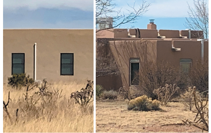
Above residences are examples of non-compliant white conduits and ducting.

4.9.1.2. Unless it can be demonstrated that it will interfere with their operation, rooftop and ground-based heating, ventilation and cooling units (exclusive of solar systems) and their associated ductwork, as well as other visible equipment and associated covers, should be earth-toned in color, similar to the approved stucco colors of Eldorado.