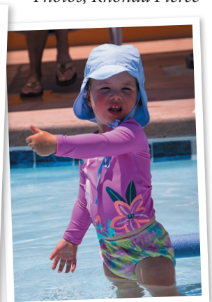
Residents of all ages had a great time at the Eldorado Community Pool this summer. Four-legged friends get their turn on Doggy Splash Day, Sunday, Oct. 2, 1–3 PM.