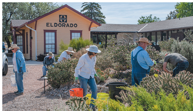
Cactus Rescue Project volunteers work in the cactus garden at the Eldorado Community Center.

Volunteers have personal and professional lives and numerous activity options. Volunteer time is valuable. The satisfaction of donating time and skills needs to be properly and adequately acknowledged. Gratitude is critical. As is making the volunteer experience as rewarding as possible. The Cactus Rescue Project offers advice, access to tools and techniques, rooted cactus and cuttings, free raffles, watermelon