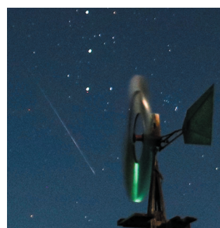
A Perseid meteor appears below the three stars of the Belt of Orion Aug. 13, 2022.

October 1–31: For early risers, the Zodiacal Light is visible in the east, for about an hour before dawn.