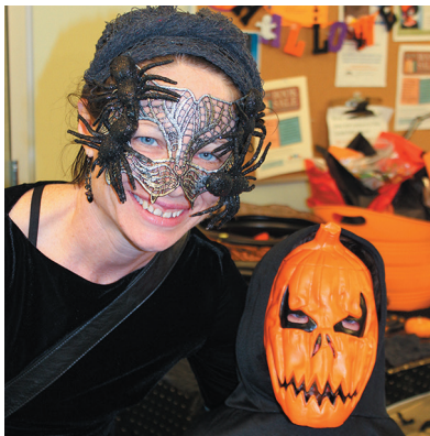
Spooky party goers enjoy VGPL's Halloween activities.

O ktoberfest! Vista Grande Public Library (VGPL) Fundraiser, Saturday, Oct. 15, 3–6 PM at the Santa Fe Brewing's Eldorado Taphouse. Beer, door prizes, challenging beer trivia and more! We thank the Brew Pub for giving us the opportunity to hold this event for the second year in a row. Tickets are $20 and can be purchased at the library, by reaching out to Board Members, or at the door.