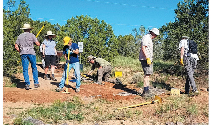
Volunteers—members of the Conservation Committee—enjoy a bluebird day while working in the Eldorado Community Preserve.