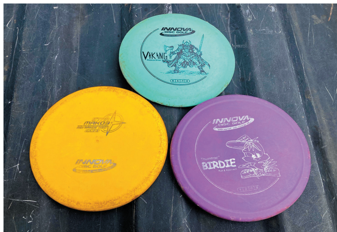
Example of 3-disc golf set

Discs can be purchased online or at local sporting goods stores. There are many great online resources for learning the game. There are also many disc golf how-to videos on YouTube channels available to help get you started including the following recommendations: