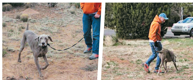
Left: Dog attempts to get too close to the rattler; Right: Dog exhibits avoidance behavior due training techniques.

For questions not covered on the club's clinic web page, contact Tom Mauter: 505 466-6511 or tjmauter@comcast.net .