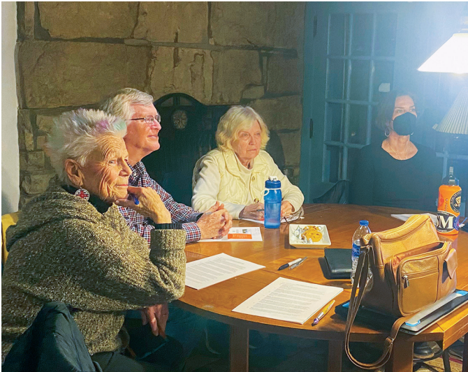
New residents participate in the HOA Skills Workshop