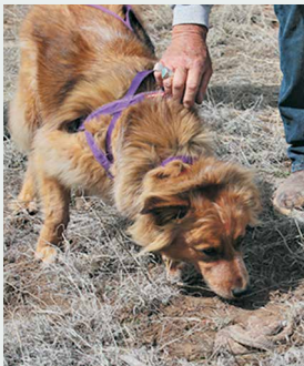
First time nose-to-nose with a rattlesnake.