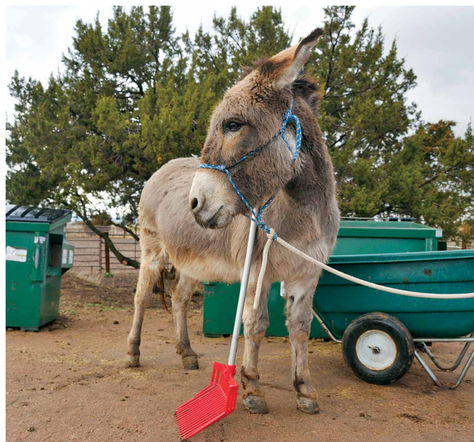
Simone the donkey is delighted to contribute to your garden!

—Article by ECIA Stable Committee