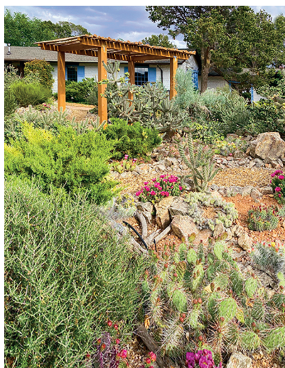
Community Center Cactus Garden