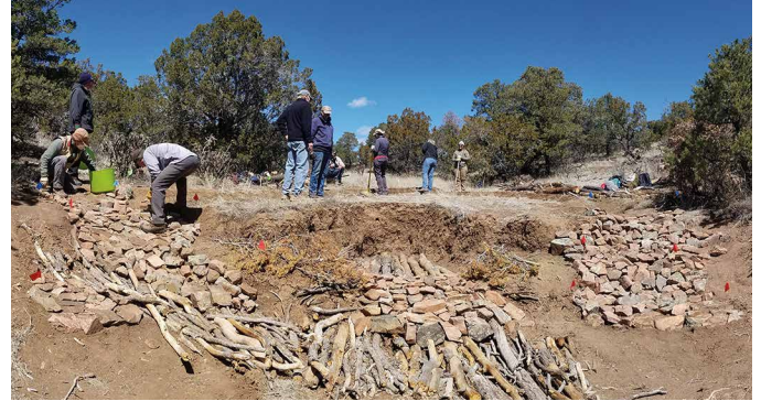
The Conservation Committee provides erosion control at the Eldorado Community Preserve.

Homeowners interested in helping with trail and other maintenance projects can sign up to be on the Committee’s Volunteer Contact List by emailing conservationchair@gmail.com . These projects usually take place during the spring and fall months, in favorable weather and trail conditions.