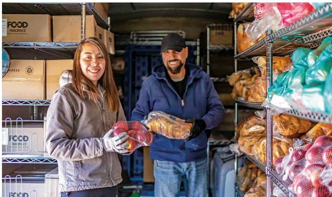
Inside the 'Food Mobile', volunteers and staff distribute items.

I started volunteering at The Food Depot in 2020, not long after the pandemic forced so many of our neighbors to lose their jobs. I thought hunger in Northern New Mexico would lessen once people were able to return to work; that didn't happen. There are currently nearly 40,000 food insecure people in Northern New Mexico, and over 12,000 of these hungry people are children. In the last three years, I have watched The Food Depot grow and create new, innovative programs that bring tasty, nutritious meals to our neighbors in need. The Food Depot now provides 700,000 meals each month to communities across Northern New Mexico, thanks to its strong network of supporters and volunteers.