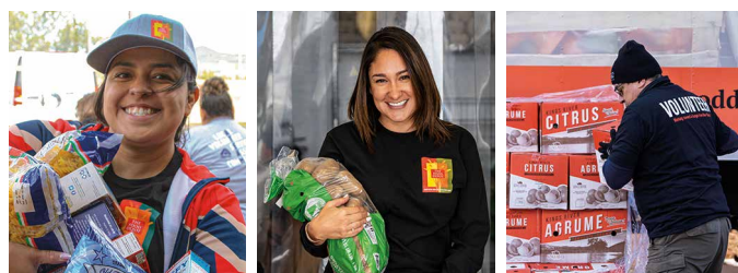
Bottom left and above: Staff and volunteers of The Food Depot help organize food drives, fundraisers, and food preparation and distribution to food insecure people in NM.

Eldorado is one of the neighborhoods participating in this drive. In 2022, Eldorado's approximately 2700 homes contributed $3,900 to N2N. We can do better! 40,000 hungry neighbors are depending on us. I decided to join this effort by chairing our Eldorado neighborhood's campaign. If you would like to be a part of this important mission and show Northern New Mexicans how generous the Eldorado community truly is, please join us. The top fundraising neighborhoods, community groups, and businesses will receive special recognition at the end of the N2N Fund Drive.