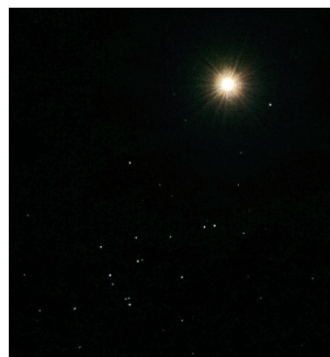
A June 2023 appulse between Venus and the Beehive star cluster.

A major astronomical event takes place mid-month when Eldorado sits within the path of totality of an annular eclipse of the Sun, turning morning into semi-night. An annular eclipse occurs when the Moon, near its