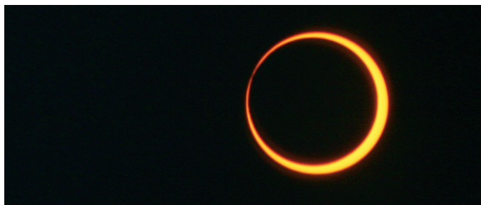
This is a photo of an annular eclipse, showing the 'Ring of Fire' caused by the Moon's slightly smaller disk, which allows a small portion of the Sun to remain in view. When a solar eclipse occurs, the Moon begins to block the right side of the Sun. After the eclipse maximum, the Moon will exit to the Sun's left.

farthest point in its orbit around Earth, passes in front of the Sun. Because the Moon appears to be slightly smaller than the Sun, due to its distance from Earth, it will only block about 91% of the Sun, leaving a narrow 'ring of fire' around the silhouette of the Moon. Eclipse details can be found in Key October Night Sky Events.