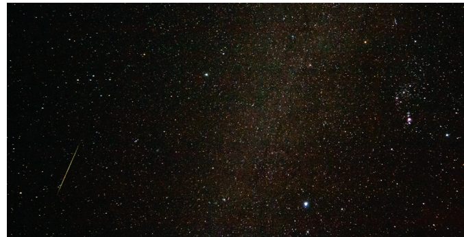
A Geminid meteor streaks to the left of the Winter Milky Way (center) and constellation Orion (right).

midday on Dec. 14 , so observing during the pre-dawn of Dec. 14 , the night of Dec. 14 , and the pre-dawn of Dec. 15 should be well-rewarded. Around the peak and under ideal conditions, about 120 meteors per hour might be seen. The waxing crescent moon will not interfere with viewing.