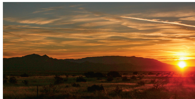
The Sun sets just to the right of the Sandia Mountains during last year's Winter solstice. This is as far south as the Sun will appear to set. At Summer solstice, the Sun will set behind the Jemez Mountains.

Dec. 21: Winter solstice occurs at 8:21 PM . At that time, winter begins in the Northern Hemisphere and the Sun begins its six-month journey northward.