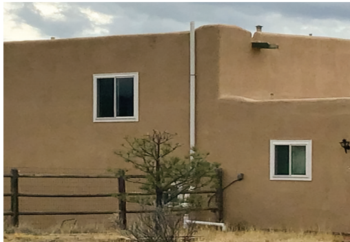
Example of non-compliant exterior ductwork.

Over the past five years the ECIA has continued to see an increase in the number of Eldorado homes that are installing the newer heating and air conditioning units that involve running exterior ducting, pipes and conduits from the roof, as well as from the exterior walls. This ducting is usually white and is often very visible to neighbors.