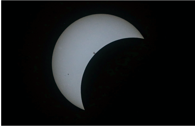
Partial solar eclipse on April 8, 2024. The Moon has covered almost half of the Sun's disk and is about to eclipse Sunspot Region 3628. Maximum eclipse, as seen from Eldorado, was 78%.

While the winter constellations set in the west, the spring constellations are well-positioned for evening viewing. Leo is due south as darkness falls on May 1 , with Virgo and Libra following in the ESE.